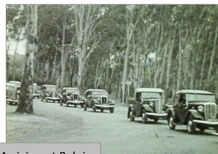
Arriving at Belair