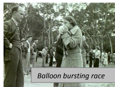
Balloon bursting race