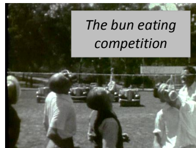
The bun eating competition

Cars taking part in the Morris 8/40 Car Clubs rally at Belair on Sunday will assemble at the G.P.O. at 9.30 a.m. The column will travel via Unley road to Belair, arriving at the main oval in the National Park at approximately 10 am. The sports programme will include; musical chairs, boys' and girls' races, tyre bowling, balloon bursting, sack races, Gretna Green races, car jumble races, paper stabbing, and bun eating competitions. Trophies will also be