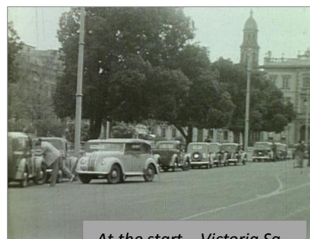
At the start – Victoria Sq.