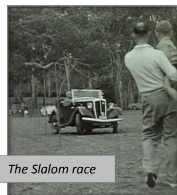
The Slalom race