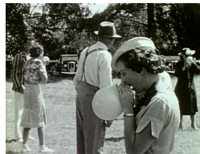
Snapshots from the first official run of the Morris 8/40 Club of SA to Clarendon